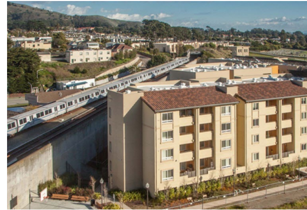
Housing near transportation in Northern San Mateo County