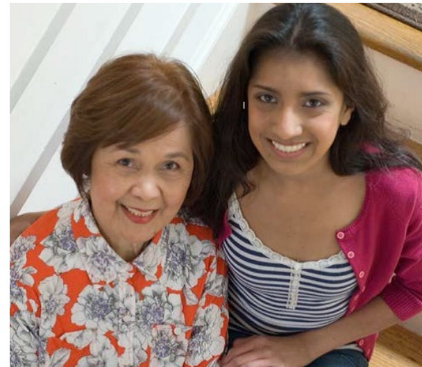
Home Sharing Participants in San Mateo County

Get additional information at HomeforAllSMC.com